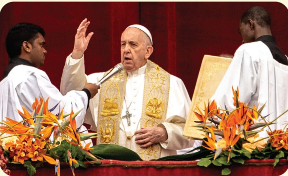
CATHOLIC NEWS AGENCY

Go to DearPadre.org to send your question and to learn more about Dear Padre .