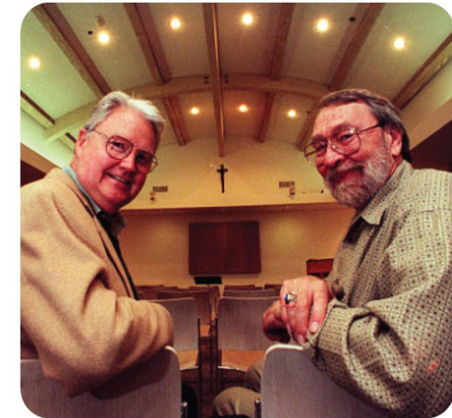
A candidate and his sponsor sit for a photo after an Order of Christian Initiation for Adults (OCIA) class.

I am happy you have responded to the stirrings of the Holy Spirit within you and answered the call to deepen your spiritual practice and journey. The Church needs you. The people of God welcome you. You are beloved among us, and your response in faith is a powerful witness, a reminder to those who may be tempted to take for granted the gift of faith. Thank you. ●